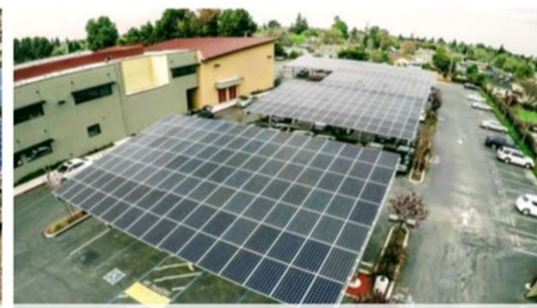
Campbell Church of Christ – 170kW

Watthub knows how to execute and do right by the client. It has been amazing to work with them with our solar customers where we have offered energy storage.