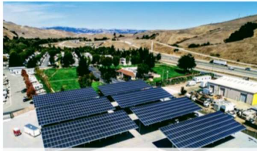
Betabel RV Park – 437kW