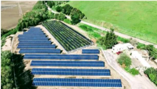
Green Valley Floral – 306kW