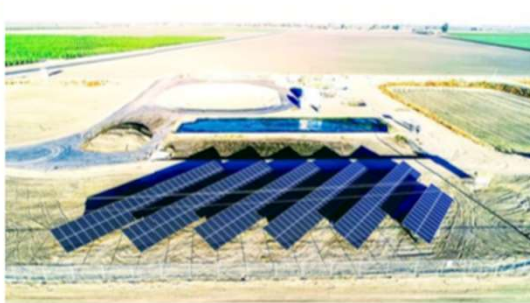
City of San Joaquin – 101kW