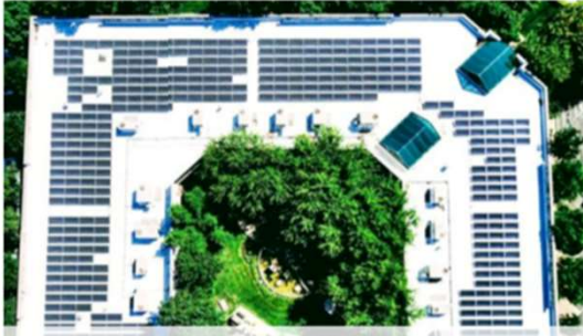
Top Grade Construction – 122kW

“Our system has yielded significant electric bills savings and higher than expected cash flow.”