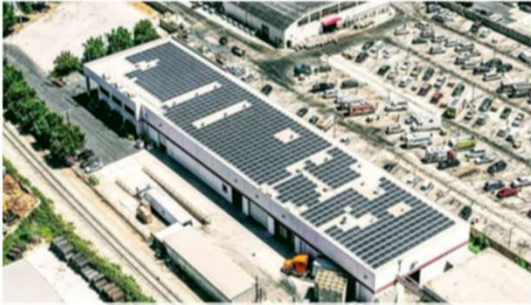
Airdrome Orchards – 305kW