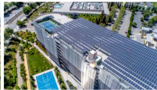
Samsung – 503kW