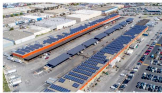
Golden Gate Produce Terminal – 1.32MW