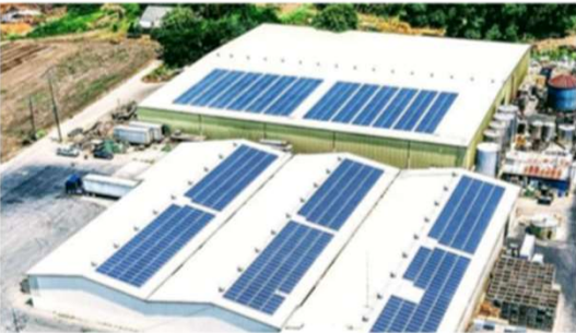
H.R Rider & Sons – 302kW