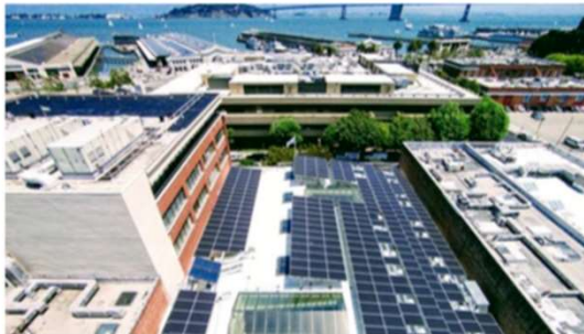
DPR Construction – 118kW