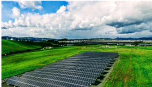
ACME Landfill – 373kW