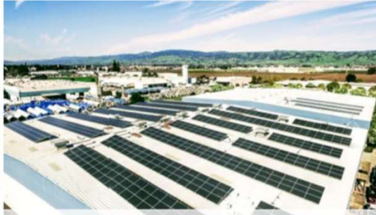
Heinzen Manufacturing – 270kW

Wonder Valley Ranch was a pleasure to work with and what better way to celebrate their 100 year anniversary then going green.