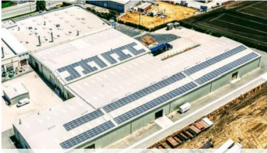
San Benito Shutters – 195kW