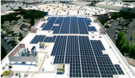
Macy's Eastridge – 467kW