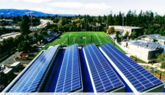
The Harker School – 125kW