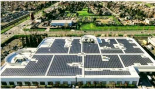
Paramit Corp – 892kW