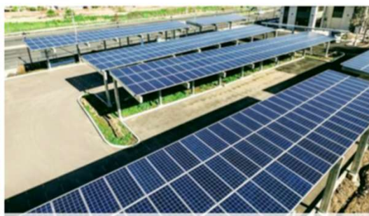
Evergreen Medical – 232kW