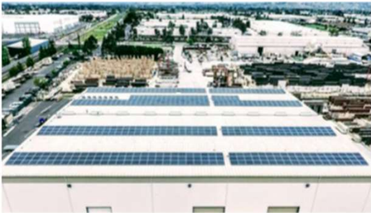
Walters & Wolf – 203kW