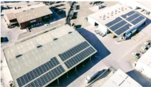
LA Hearne – 146kW