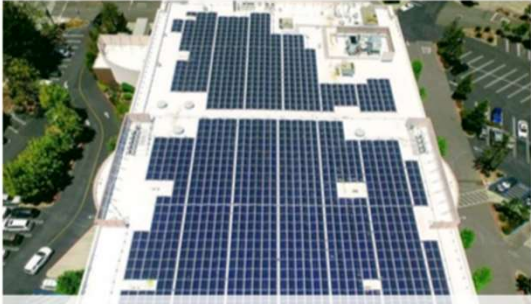
Macy's Hayward – 549kW