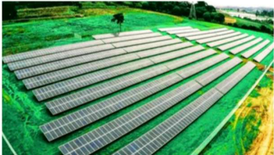
Classic Salads – 1.18MW