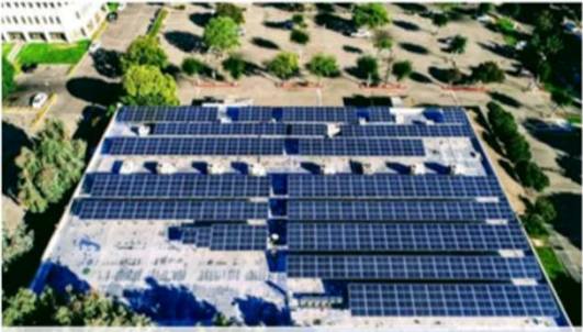
Dublin Bowl – 233kW