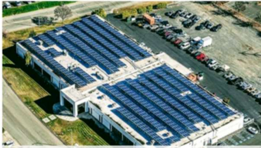
Therm X – 315kW

“We were pleased with the service, as schedules were maintained and projects were completed in a timely manner.”