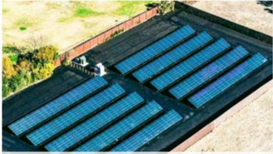
Jenny Strand Park – 125kW