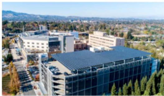
John Muir Health – 371kW