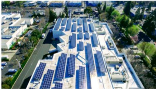
NVIDIA – 456kW