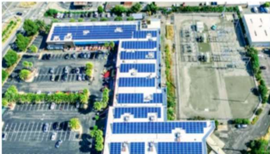
Cost Plus Center – 346kW