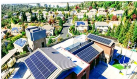
El Dorado Hills Fire Dept. – 40kW