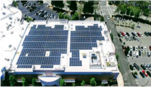
Macy's Capitola – 424kW