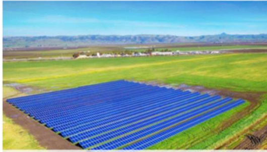
Willoughby Farms – 922kW

WattHub has a national reach of project finance. We had five offers on our project for third party finance.