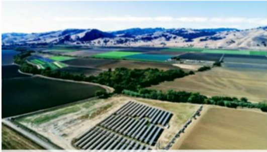
Uesugi Farms – 1.39MW