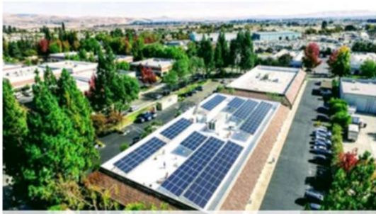
Serpentine Office Park – 100kW