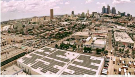
Cathay LA – 450kW