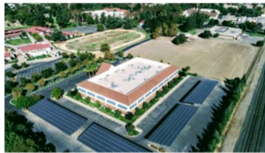
Valley Mountain Regional – 3221kW