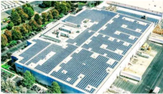
Synnex Corp. – 920kW