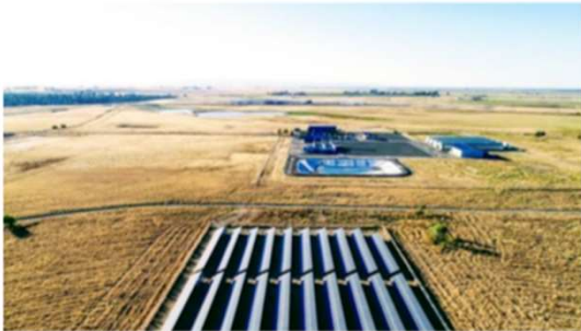
City of Rio Vista – 510kW