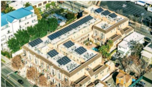
2 nd Street COA – 80kW