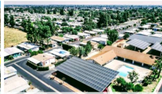
San Joaquin Estates – 307kW